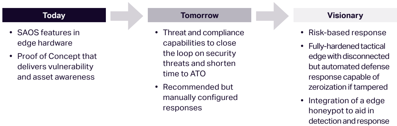
Figure 2. Status of the edge security solution